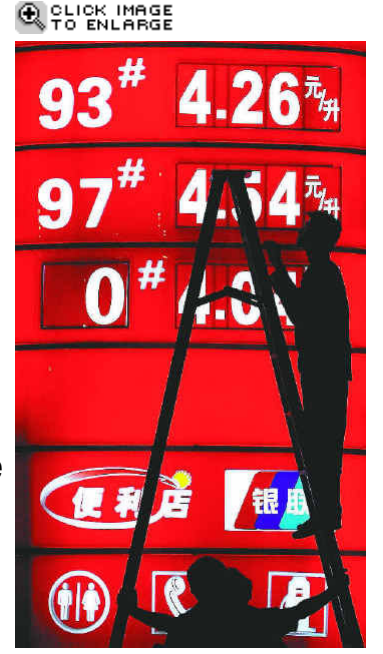
China's state-owned energy companies have been scouring the globe for oil and gas deals, and India has been trying to satisfy its own growing energy demand. The oil price board was changed recently at a Sinopec gas